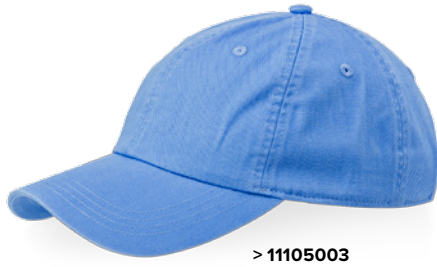
> 11105003 ocean blue