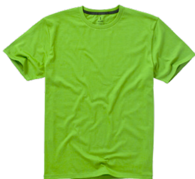
♂ 3801168 ♀ 3801268 apple green