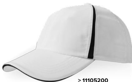
> 11105200 white