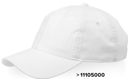
> 11105000 white