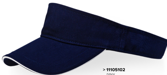
> 11105102 navy