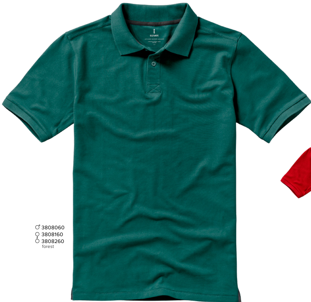
♂ 3808060 ♀ 3808160 ○ 3808260 forest