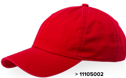
> 11105002 red

Recommended decoration: Embroidery Compliance: AZO • Formaldehyde • PCP • Uses non-carcinogenic dyestuff