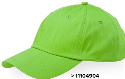
> 11104904 apple green