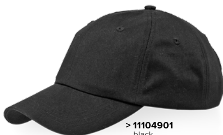
> 11104901 black