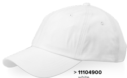
> 11104900 white