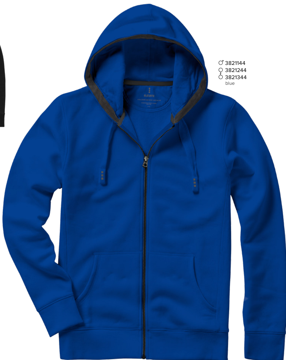
♂ 3821144 ♀ 3821244 ⊖ 3821344 blue