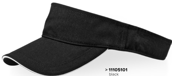
> 11105101 black