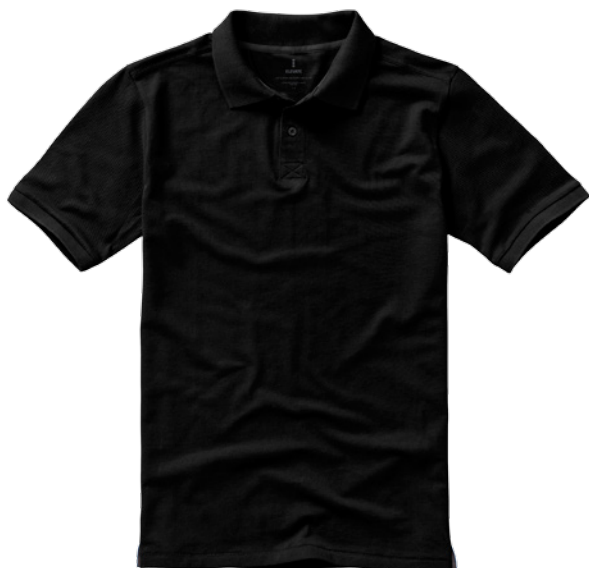
♂ 3808099 ♀ 3808199 ○ 3808299 black