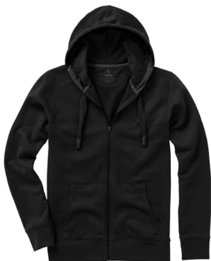
♂ 3821199 ♀ 3821299 ⊖ 3821399 black