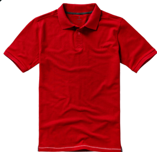
♂ 3808026 ♀ 3808126 ○ 3808226 red-white