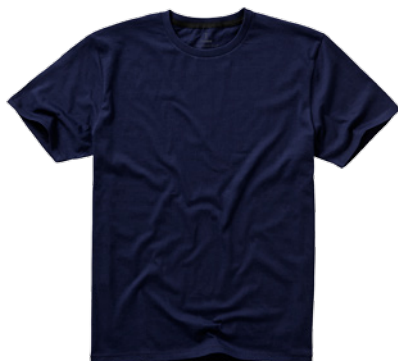
♂ 3801149 ♀ 3801249 navy