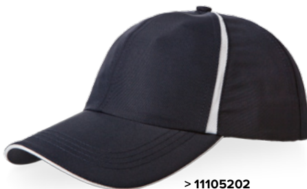
> 11105202 navy