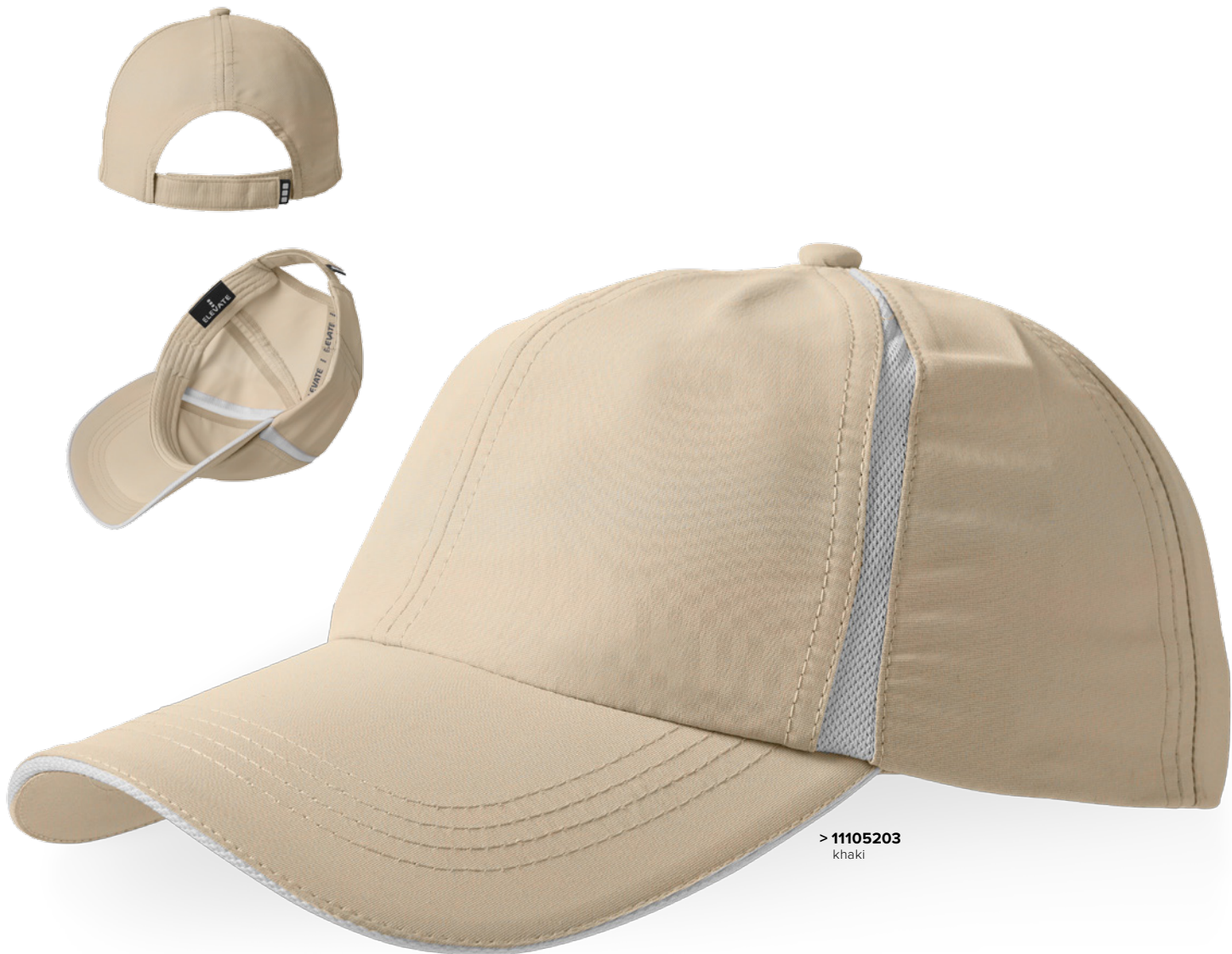
> 11105203 khaki