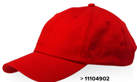
> 11104902 red

Recommended decoration: Embroidery Compliance: AZO • Formaldehyde • PCP • Uses non-carcinogenic dyestuff