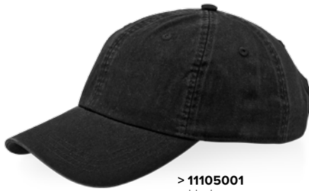
> 11105001 black