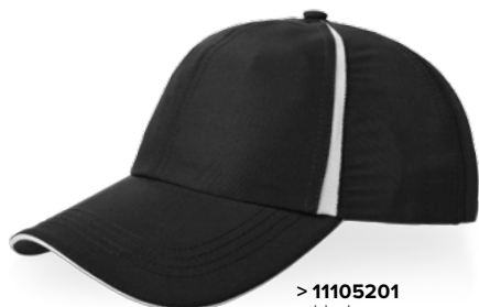
> 11105201 black

Recommended decoration: Embroidery Compliance: AZO • Formaldehyde • PCP • Uses non-carcinogenic dyestuff