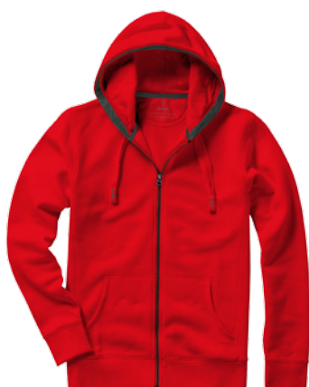
♂ 3821125 ♀ 3821225 ⊖ 3821325 red