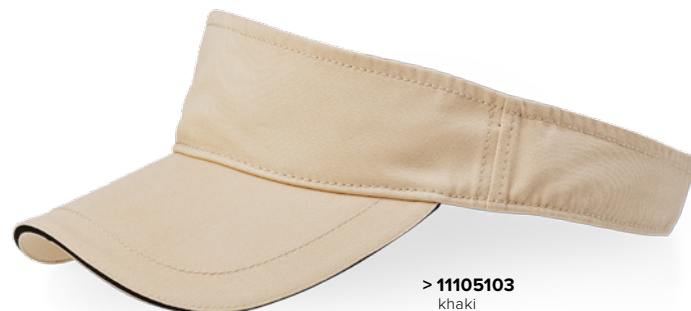
> 11105103 khaki