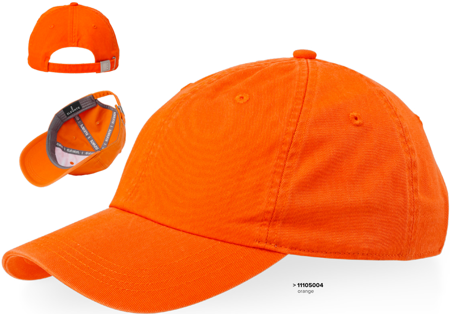
> 11105004 orange