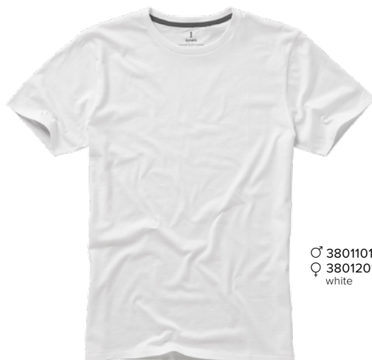
♂ 3801101 ♀ 3801201 white