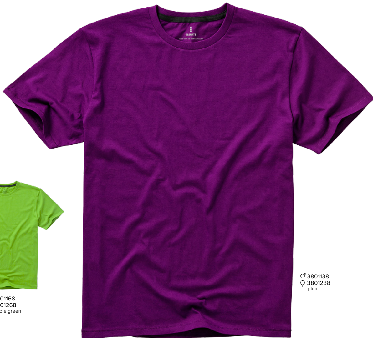
♂ 3801138 ♀ 3801238 plum