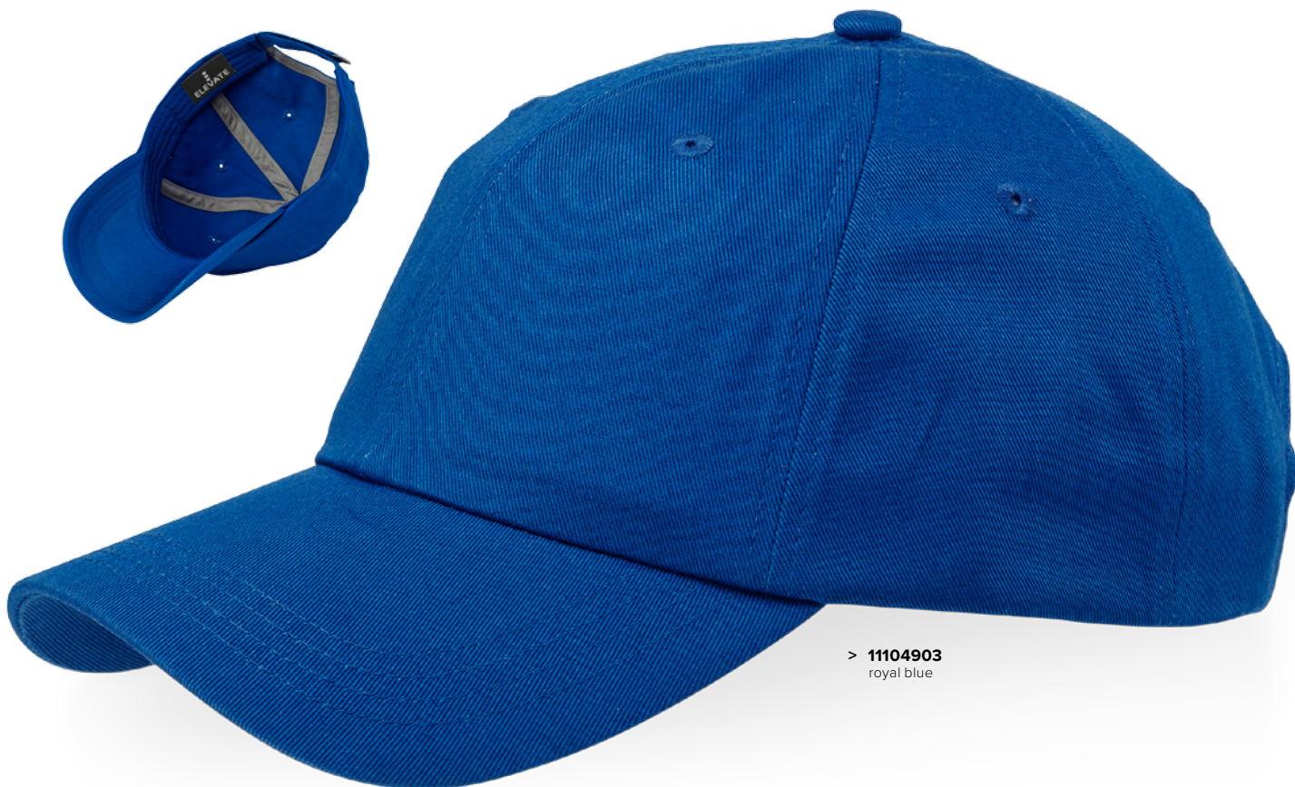
> 11104903 royal blue