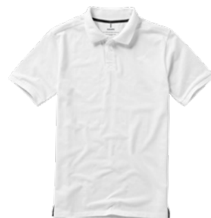
♂ 3808001 ♀ 3808101 ○ 3808201 white