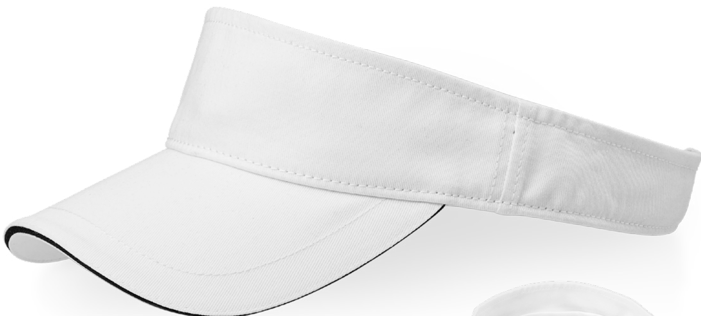
> 11105100 white