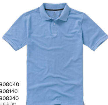
♂ 3808040 ♀ 3808140 ○ 3808240 light blue