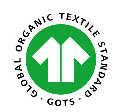
Certified by Control Union CU 1019665