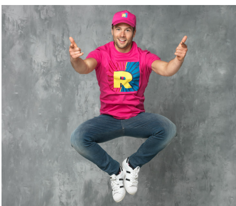
3802821 HEROS 2XS-3XL 38666210 FENIKS