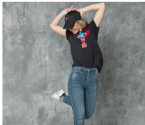
3802899 HEROS 2XS-5XL 38666990 FENIKS