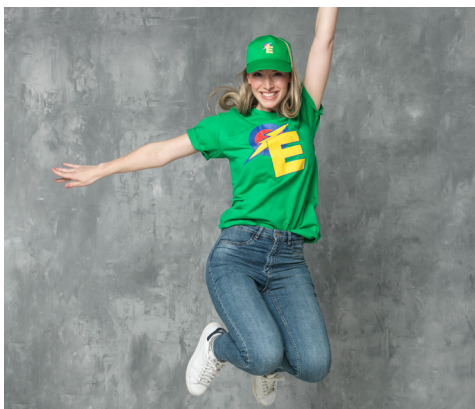
3802869 HEROS 2XS-3XL 38666690 FENIKS