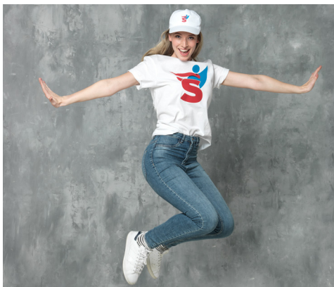
3802801 HEROS 2XS-5XL 38666010 FENIKS