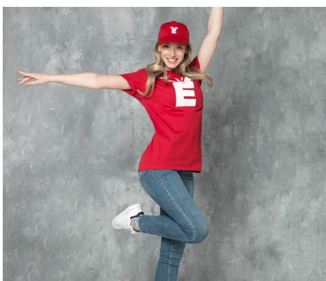
3802825 HEROS 2XS-5XL 38666250 FENIKS