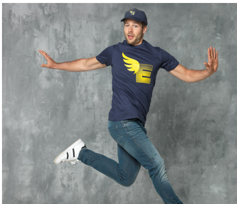
3802849 HEROS 2XS-5XL 38666490 FENIKS