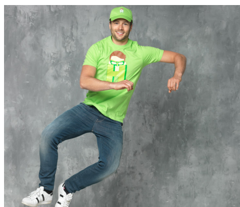
3802868 HEROS 2XS-3XL 38666680 FENIKS