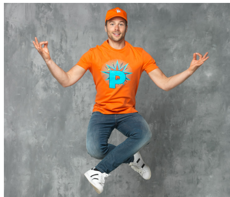
3802833 HEROS 2XS-3XL 38666210 FENIKS