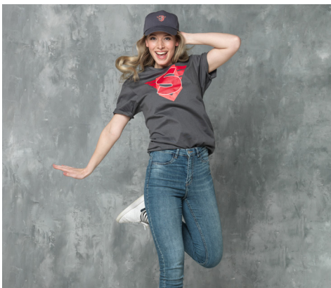
3802889 HEROS 2XS-3XL 38666890 FENIKS