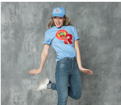
3802840 HEROS 2XS-3XL 38666400 FENIKS