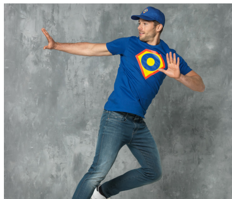
3802844 HEROS 2XS-3XL 38666440 FENIKS