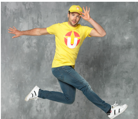
3802810 HEROS 2XS-3XL 38666100 FENIKS